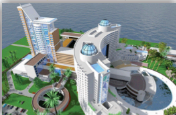
An artistic impression of the proposed Ronald Ngala Utalii college, 5 star hotel under construction