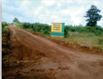
Solian Gardens site with graded roads