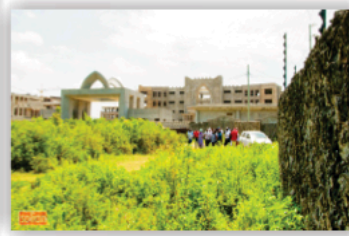
Ronald Ngala Utalii college & 5 Star Hotel. Construction in progress

PRICES FOR THE PLOTS From Ksh. 1.97 Million: Pay Ksh. 500,000 Down Payment and balance in 6 equal instalments