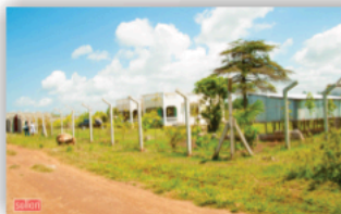
A view of Solian Twelve upcoming developments

PRICE From Ksh. 2M Pay Ksh. 30% Down payment and balance in 6 Equal installments.