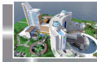
On going construction of Utalii University

PRICE Plots From Ksh. 1.7M Pay 30% deposit and balance in 6 Equal installments.